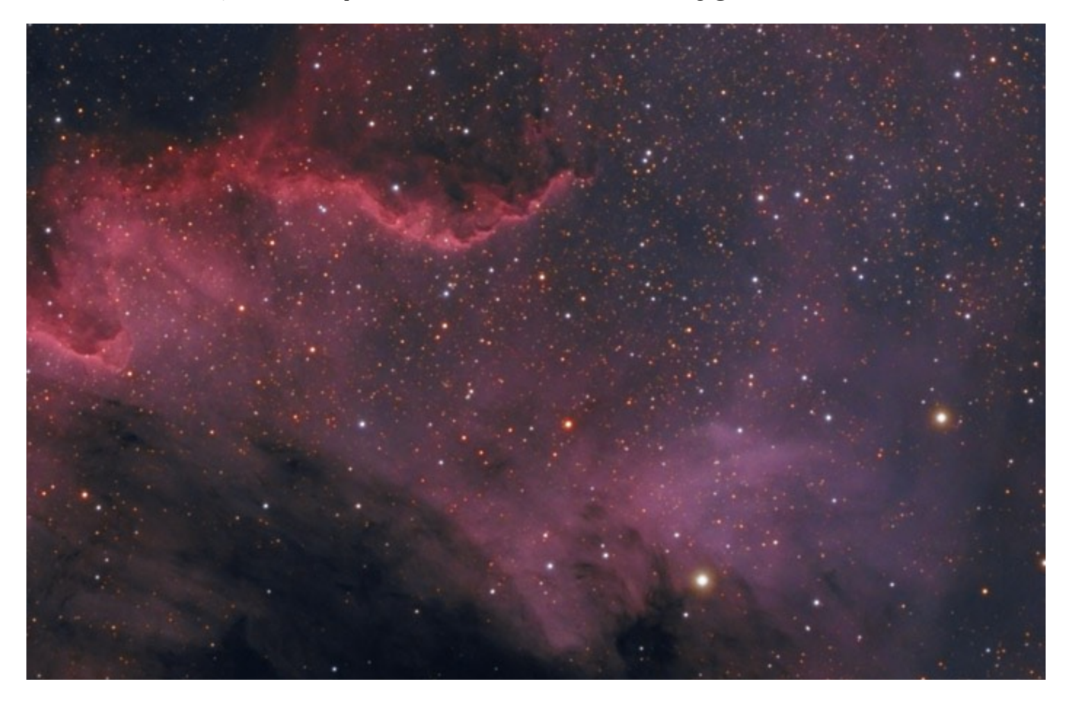
NGC 7000, close-up of N. Amer. Nebula in Cygnus