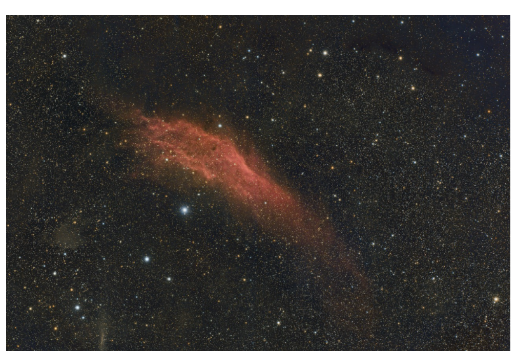
Imaged at Rusty's, Rodeo NM - October 2020