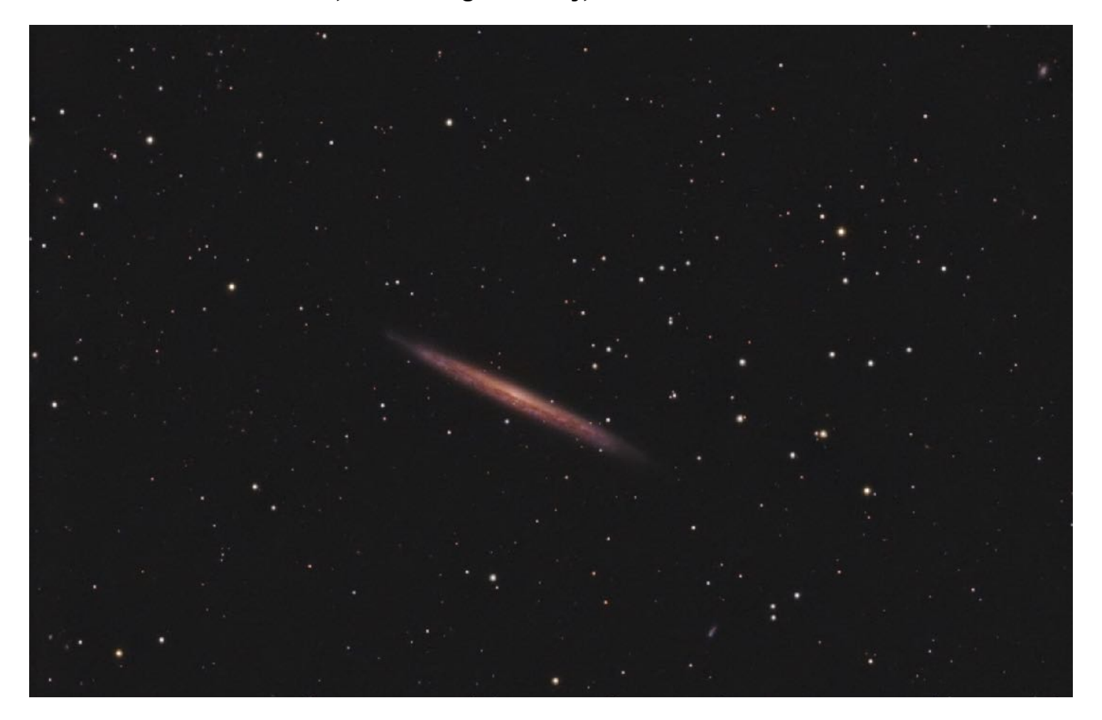
NGC 5907, Knife-Edge Galaxy, in Draco - Jeff Johnson

Here is my latest imaging result from my backyard portable setup, using my TOA-130 (5") scope on my AP1100GTO mount w/QSI 690wsg camera.