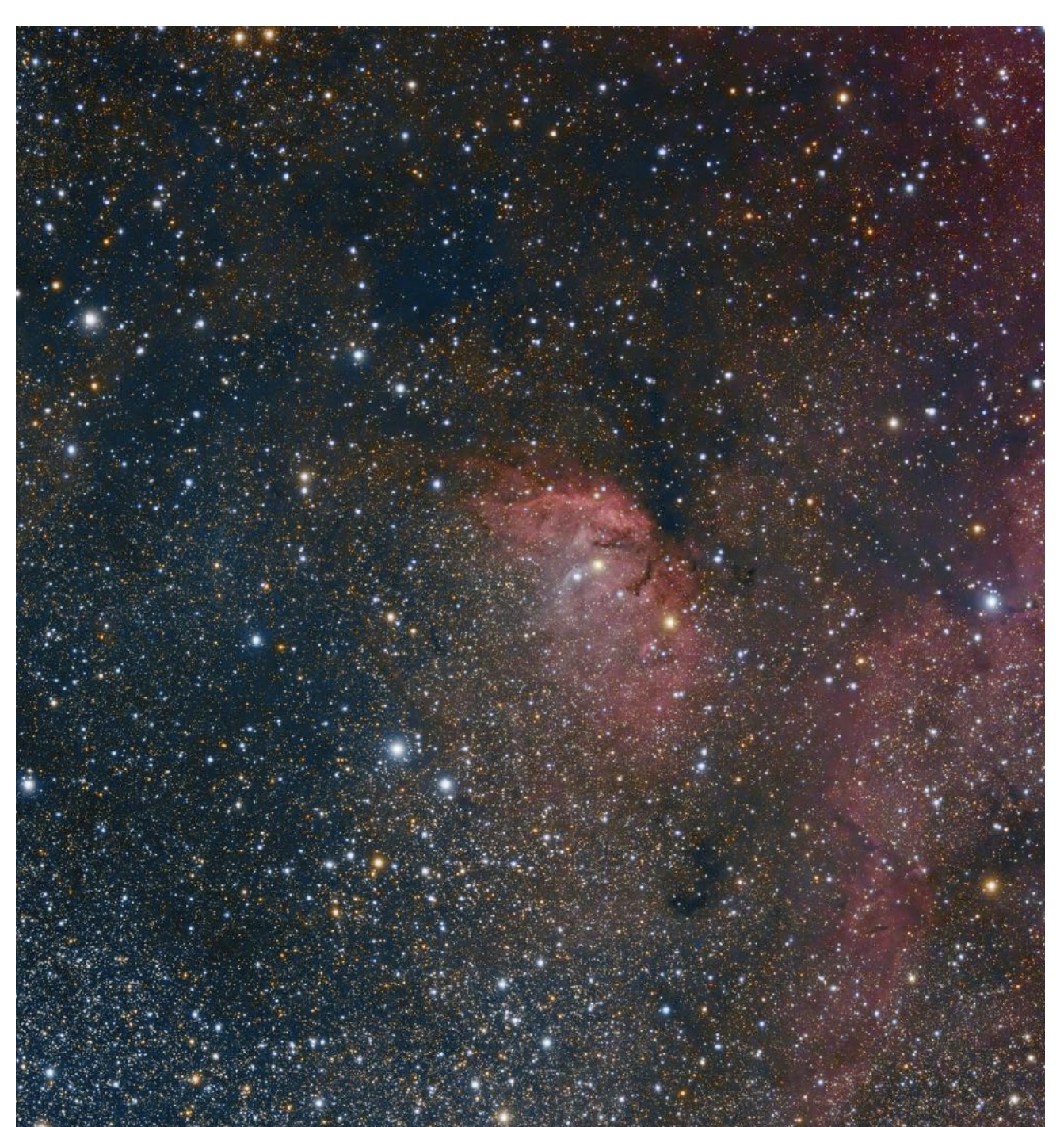
The Tulip - Sh2-101 in Cygnus - Bob Kimball

This image was take from Las Crucess, NM. Lots of sky glow and 95° temperatures. 120 subs.:The Tulip Nebula, also known as Sharpless 101 (Sh2-101), is a H II region emission nebula located in the constellation Cygnus. It is about 6,000 light-years from Earth and about 70 light-years across..