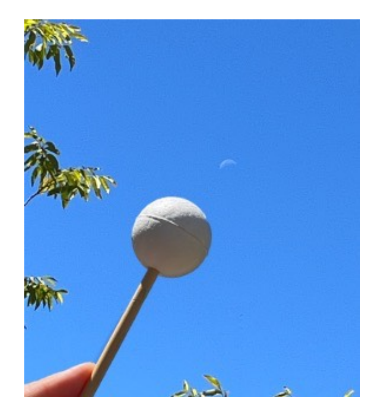
Image of waning crescent Moon shown next to a ball on a stick that is lit by the Sun on the same side as the Moon, with trees and a blue sky in the background. Try this with an egg or any round object when you see the Moon during the day!

By August 16th, the Moon has gone through its crescent phase and is now only showing its dark side towards the Earth. Did you know the dark side and the far side of the Moon are different? The Moon always shows the same face towards Earth due to the gravitational pull of Earth, so the far side of the Moon was only viewed by humans for the first time in 1968 with the Apollo 8 mission. However, the dark side is pointed at us almost all the time. As the Moon orbits the Earth, the sunlit side changes slowly until the full