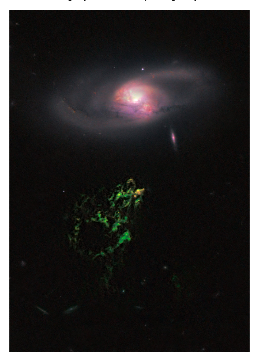
Hanny's Voorwerp and the neighboring galaxy IC 2497, as imaged by Hubble.

Photo of a cloudy green object, nebulous and faint, slightly below an elliptical galaxy.